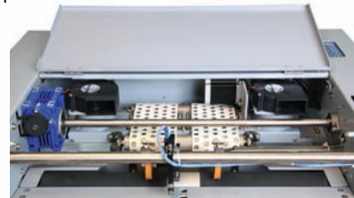
SF-200 Suction Feeder with double feed detection

The SF-200 Suction Feeder (standard on the Ultra 200A, optional for the Ultra 200) minimizes reloading and increases productivity. Jobs can also be hand fed for shorter runs. With a 7.5" stack capacity, the SF-200 utilizes an air suction feeding system that feeds from the top of the stack to reduce marking on the sheets. The feeder automatically sets the gap between each sheet to ensure no sheets overlap while the double feed detection ensures the coating process stops when two or more sheets have been fed.