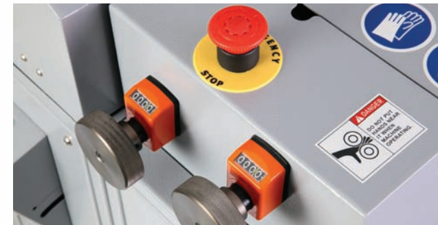
Ultra 200: Simple to adjust coating roller gap dials by 0.1mm increments Ultra 200A: Only a one-time adjustment needed