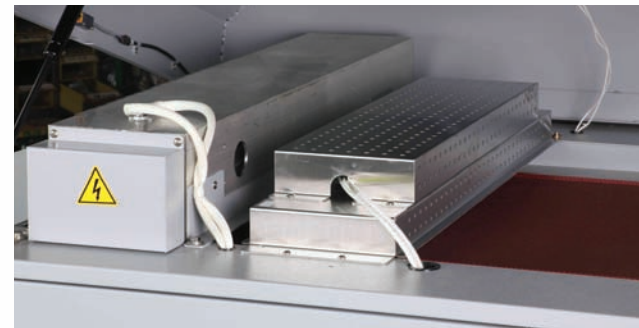
Long conveyor with UV and IR lamps