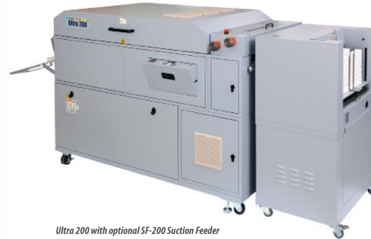
Ultra 200 with optional SF-200 Suction Feeder

The Ultra 200/200A provides the utmost safety throughout the entire process with detection sensors in place for paper jams, over heating, open safety cover, and low coating. As the sheets are cured by the UV lamp and delivered into the exit tray, the UV lamp's ventilation draws out heat from the main chamber providing safe operating temperatures at all times.