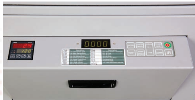
Intelligent Control System